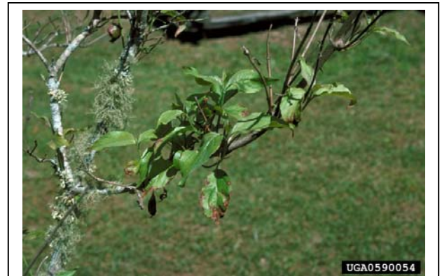
Figure 6. Watersprouts forming on a branch.

Pesticide and management recommendations obtained from Part II Guide to Pest Management around the Home – 2005-2006 Pesticide Guidelines , Cornell Misc. Bulletin S74II. Contact our office for information on ordering copies.