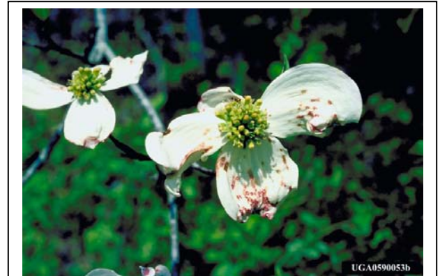
Figure 5. Spotted and blighted flower bracts.